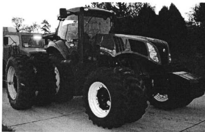
NEW HOLLAND T8.420 DIESEL